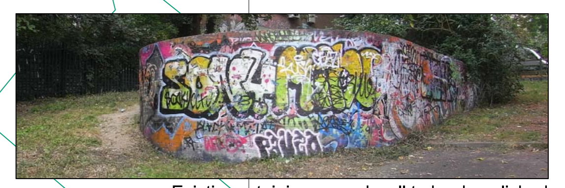
Existing retaining curved wall to be demolished