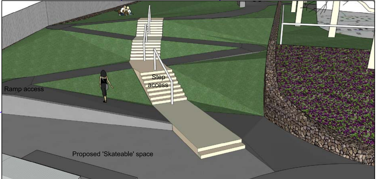
3D MODEL VISUALISATION SHOWING THE PROPOSED STEP / RAMP ACCESS FROM THE PROPOSED 'SKATEABLE' SPACE TO THE PROPOSED GRASS AREA

Install additional dog bins at locations to be agreed