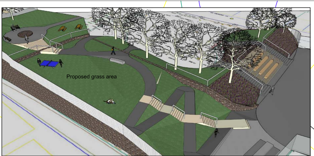
3D MODEL VISUALISATION SHOWING THE PROPOSED GRASS AREA

PHOTOGRAPHS SHOWING EXISTING PARK FEATURES