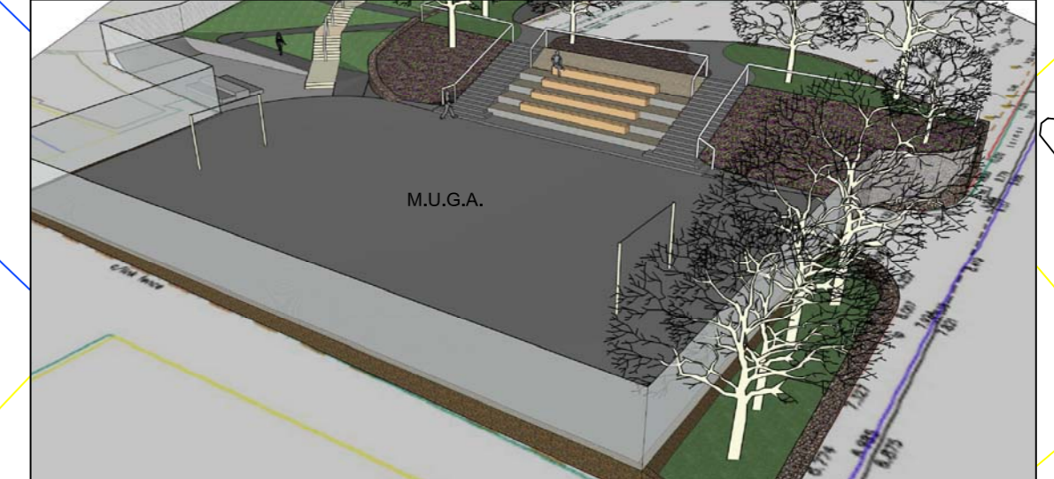
3D MODEL VISUALISATION SHOWING THE PROPOSED LEVELED M.U.G.A.