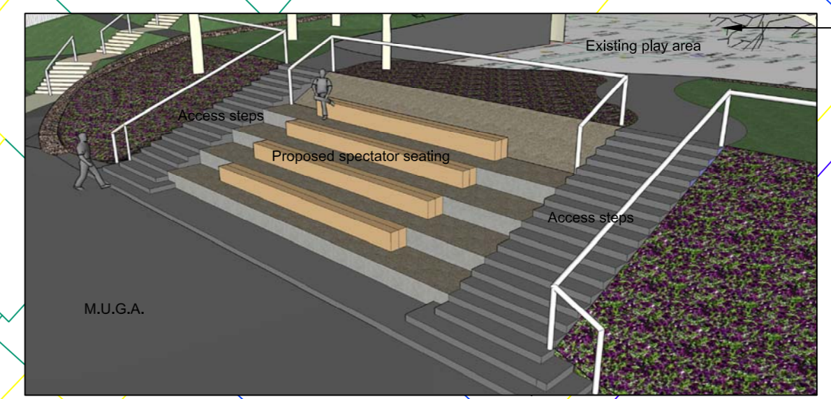
3D MODEL VISUALISATION SHOWING THE PROPOSED SPECTATOR SEATING / STEPS CONNECTING THE M.U.G.A. WITH THE EXISTING PLAY AREA

Proposed spectator seating and access steps with max. 800mm high hand rail. Construct steps on top of existing retaining structure, 150mm riser, 400mm tread. Install hardwood oak timber sleepers 500mm high to create spectator seats and platforms from timber retaining edge, pegs and compacted gravel surface. Bottom step to be concrete with a smooth float finish, a dual purpose step / skate facility.